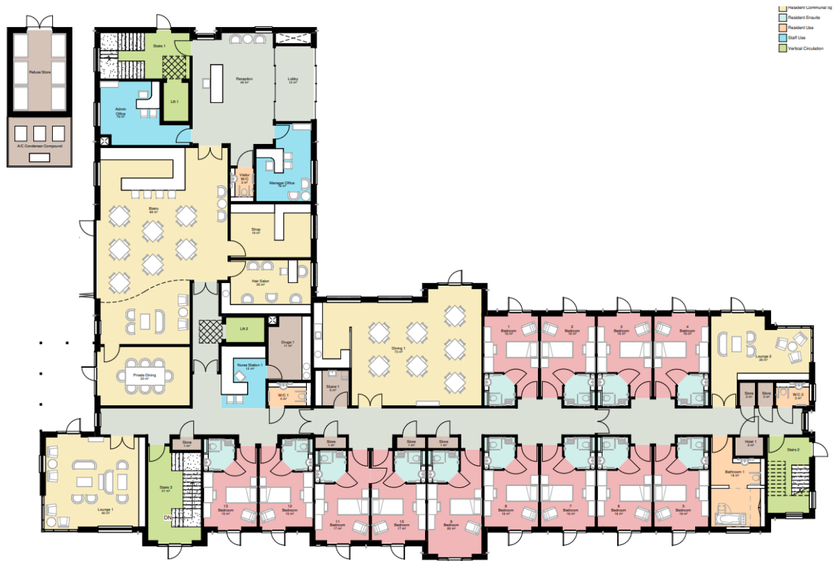
Proposed ground floor plan