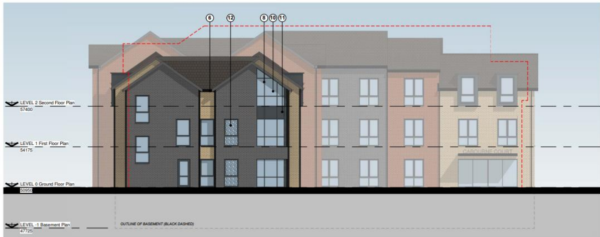
Proposed North-East Elevation