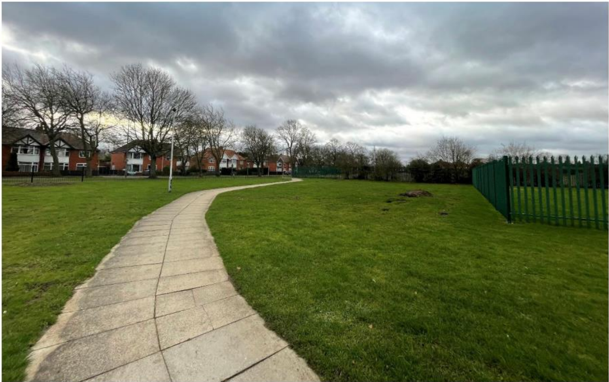
Figure 4: Existing footpath to Nettleham Road