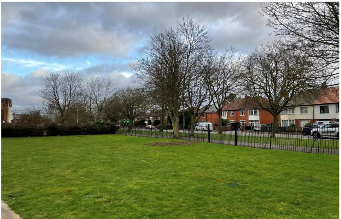
Figure 3: The site looking at Nettleham Road