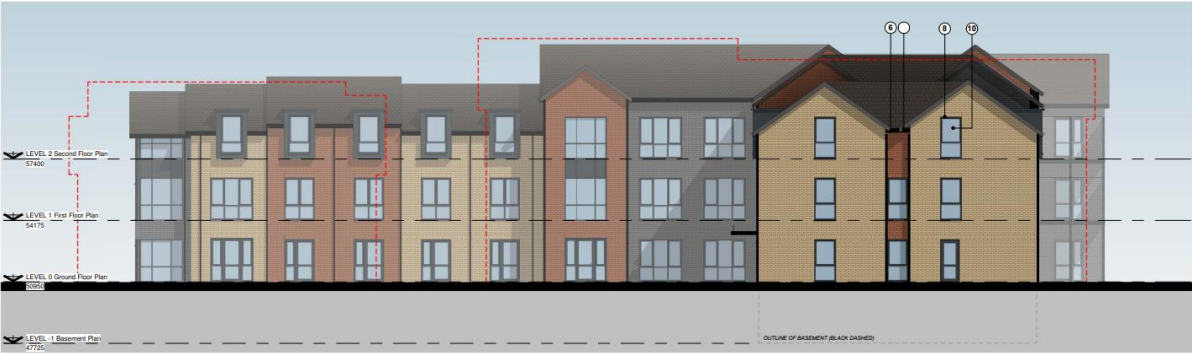
Proposed North-West Elevation