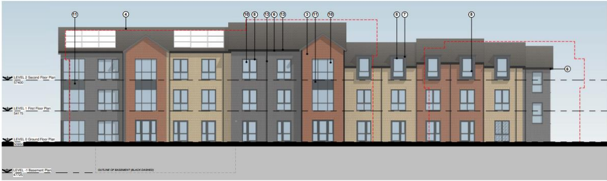
Proposed South-East Elevation