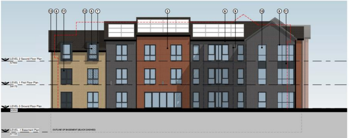
Proposed South-West Elevation